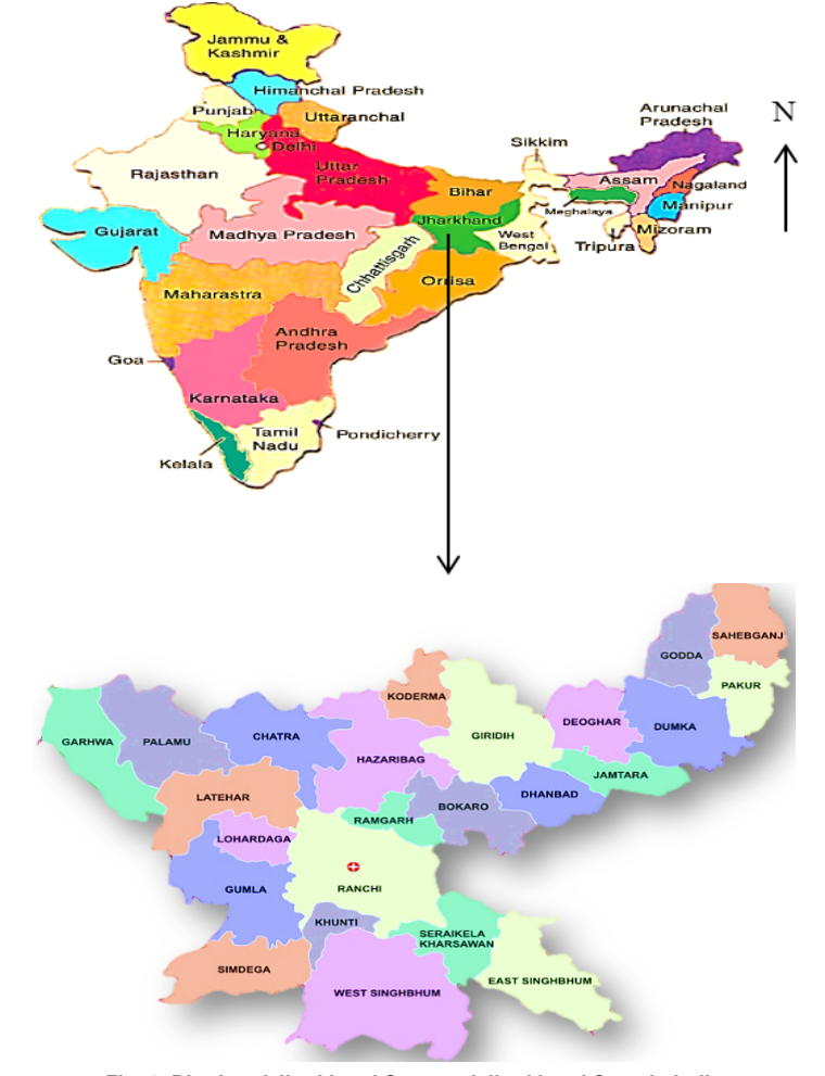
Fig. 1. District of Jharkhand State and Jharkhand State in India

The selected study area for our review study is Jharkhand (Fig. 1). Jharkhand is one of the newest states of India and located in the eastern part of India.