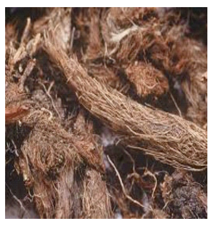
Fig.1: Nardostachys jatamansi roots

hypolipidemic, hepatoprotective, neuroprotective, anti-ischemic, antiarrhythmic and anticonvulsant activities. The roots and rhizomes of Nardostachys jatamansi have been used to treat hysteria, syncope epilepsy, and mental weakness. It also exhibits cardio protective activity and used in the treatment of neural diseases. The essential oil obtained from the roots shows various pharmacological activities including antimicrobial, antifungal, hypotensive, antiarrhythmic and anticonvulsant activity. Sesquiterpene is the major component of N. jatamansi plant, and also include jatamansone, nardostachone. The present article summarizes review on plant, its phytochemistry and pharmacological activities which have been reported<sup>2</sup>.