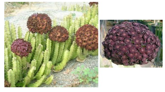
Fig. 1. Caralluma russeliana plant<sup>17</sup>

Caralluma russeliana, occupy the rocky mountains of Al Baha region, situated on southern part of Saudi Arabia (Fig. 1). This small, erect and fleshy, perennial herbs have been used in folk medicine in the treatment of cancer, diabetes, inflammation, fever, tuberculosis, skin rashes, snake bite and scorpion bite8-12. Recent studies have reported that C. russeliana stem extracts possess significant antidiabetic potential and caused reduction in complications such as body weight, lipid profile, AST, ALP in STZ induced rats<sup>13</sup>. These medicinal values are attributable to the phytoconstituents particularly pregnane glycosides, russeliosides A-D, flavone glycosides, luteolin, which have been isolated from this plant<sup>14-16</sup>. The above studies encouraged us to explore this plant from AL Baha region, KSA. Therefore, in this work, we investigated the antioxidant, anticancer and antimicrobial studies of C. russeliana, which is the first study from this place.