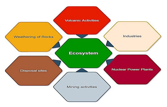
Fig. 1. Uranium sources in the ecosystem

Natural U comprises three isotopes: U<sup>238</sup>, U^{\rm 235}, and U^{\rm 234\,19}. It contains about 99.283% of U^{\rm 238} by weight and rest U235 and U234 20. U238 has a half-life of 4.5x10<sup>9</sup> years and is an exceptionally long-lived isotope. Uranium is a radioactive element found in all types of soils, rocks, and water sources<sup>21</sup>. Uranium comes from both natural and anthropogenic sources (Fig. 1). Weathering of the rocks and volcanic eruption is considered the primary sources of natural U in soil<sup>22,23</sup>. Other sources of Uranium includes mining, extracting and purifying ore, coal ash generation, phosphate fertilizer production, and waste from nuclear power plants<sup>24</sup>. Wang et al., 2019 concluded that mining is the primary anthropogenic source of U contamination in soil and water<sup>25</sup>. With ever exploding global population increase, this anthropogenic content of U will increase in the future due to higher demand for minerals, electricity, and food<sup>8,26-28</sup>.