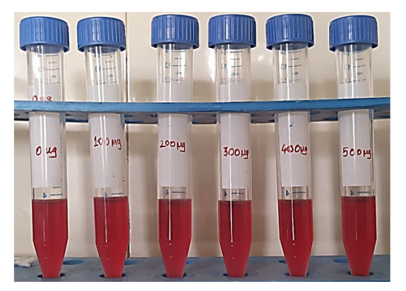
Fig. 4. Dose dependent anti-inflammatory activity of (CuL')