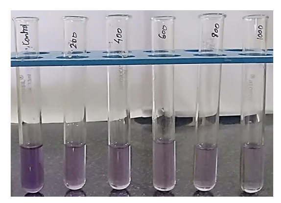
Fig. 3. Antioxidant activity of (CuL') at various concentration

% Protection against hemolysis = 100 - (O.D. of test sample / O.D. of control) \times 100