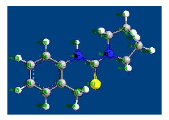
Fig. 1: Optimized structure of 1-O-Tolyl-3,3 diethyl thiourea

It is found that there is exceptionally strong conformity between the values of inhibition