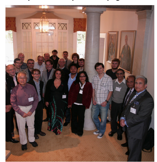
Fig. 3: scientists who attended the first Horizontal Gene Transfer and the Last Universal Common Ancestor conference at the Open University, Milton Keynes, UK, on 5-6 September 2013